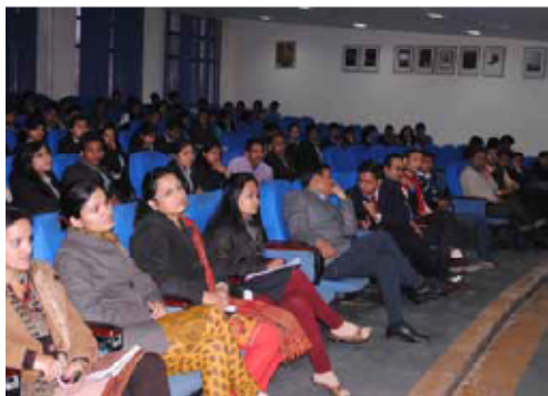
A cross section of faculty members, students of UG & PG of ITM-SOB at the session of panel discussion on HRM & Industrial Law.