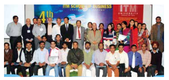
4<sup>th</sup> 7 Day National Workshop on Research Methodology and Management and Statistical Analysis Using IBM SPSS statistics 21.0 held from December 9-15, 2013.