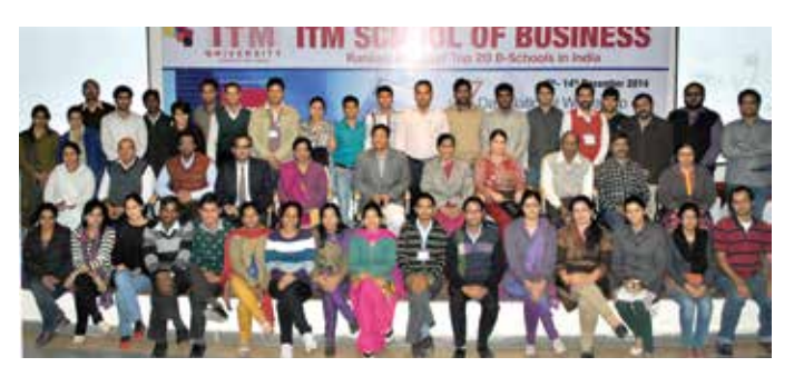
6th National Workshop on Research Methodology on Management and Statistical Analysis Using IBM SPSS 22.0 held from Decemebr 8- 14, 2014.