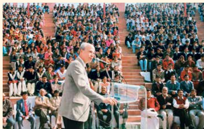
Roger Kornberg Nobel Laureate, Dept. of Structural Biology, Stanford University, USA